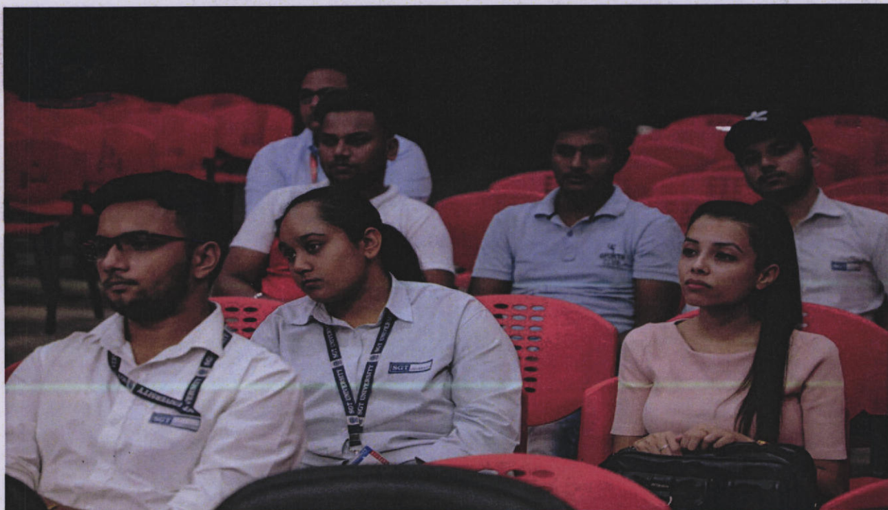
Students attending the workshop