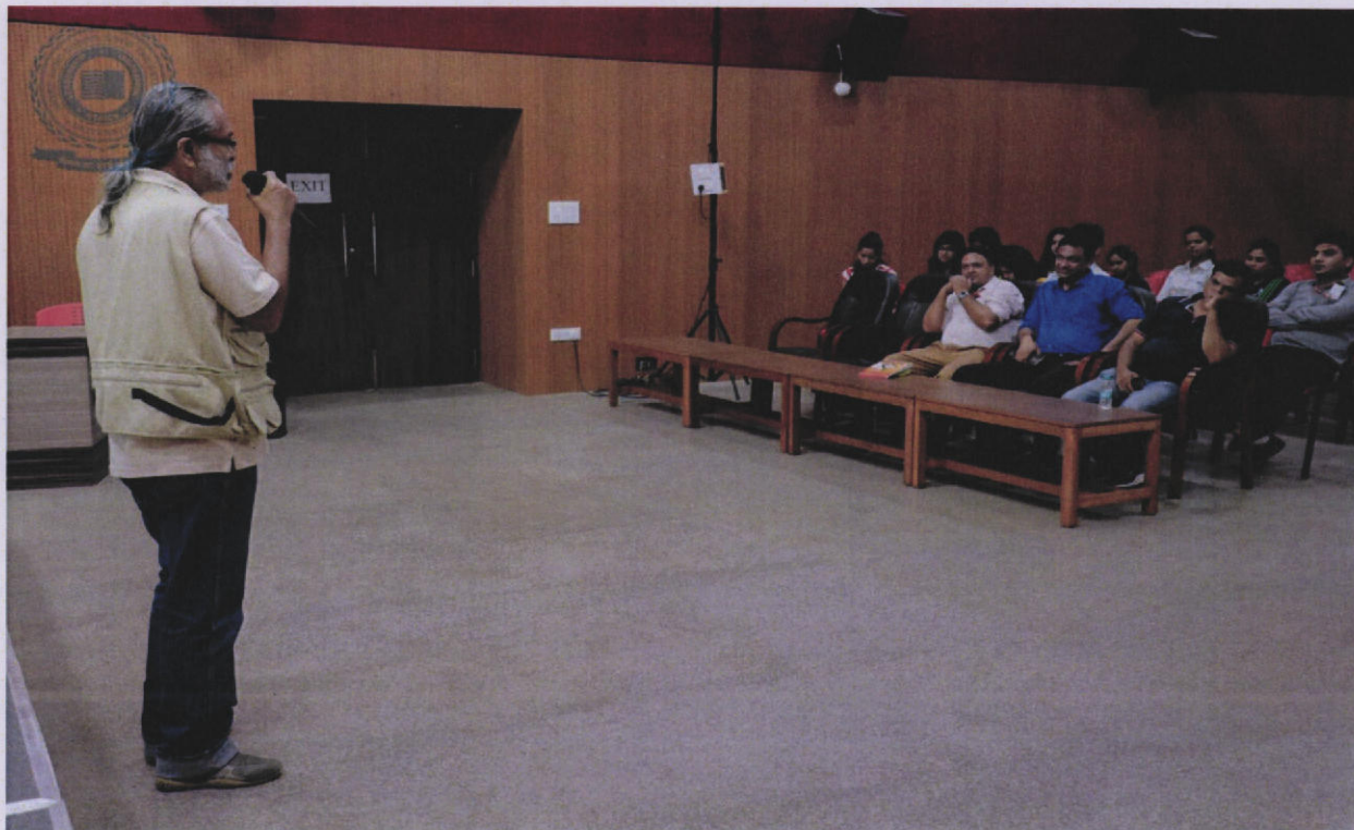
The delegates of the Hands on training session

Budhera, Gurugram-Badli Road, Gurugram (Haryana) – 122505 Ph. : 0124-2278183, 2278184, 2278185