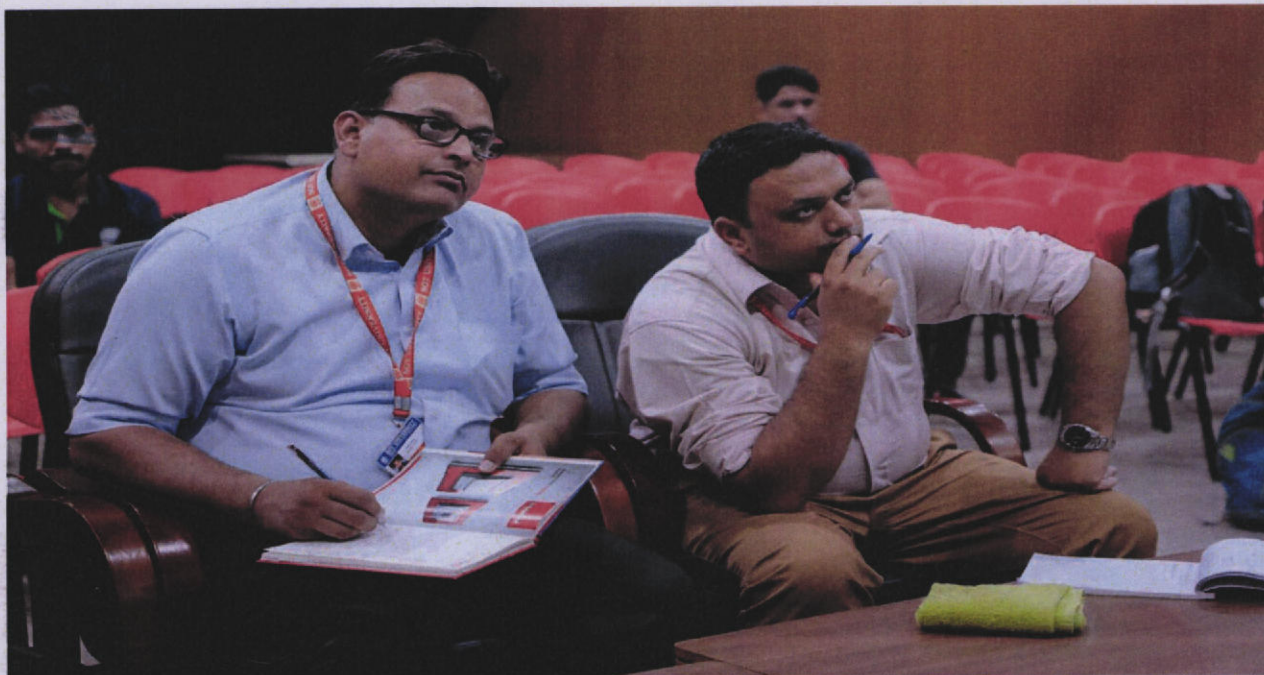
The faculty members attending the workshop

Budhera, Gurugram-Badli Road, Gurugram (Haryana) – 122505 Ph. : 0124-2278183, 2278184, 2278185